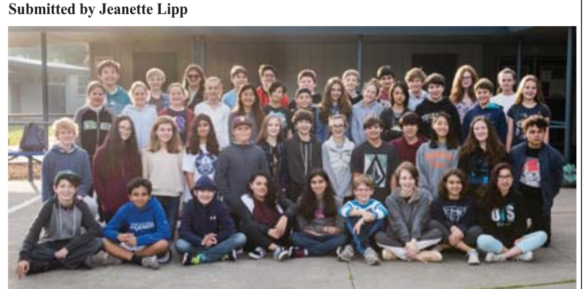
The Jukebox cast and crew of "All Shook Up Young@Part Edition" during one of the rehearsals.

Bulldog Theater will present the musical, "All Shook Up Young@Part" April 26-28 at OIS.